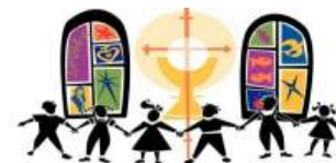
Ministerio de niños:

Confesiones: Sábados, 3 PM, Miércoles, 5 PM, Jueves 5:30 PM en Español solamente